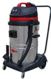
Wet & Dry Vacuum Cleaner