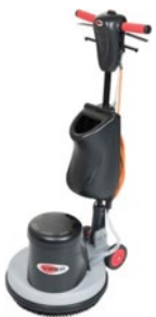
Dual Speed Single Disc Machine