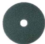
3M Blue Scrubbing Pad