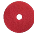
3M Red Buffing Pad