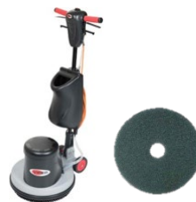
Dual Speed Single Disc Machine & 3M Blue Pad