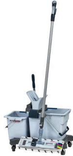
Vileda Microfibre Flat Mopping Unit