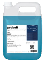
Probuff Spray Buff