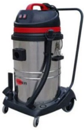
Wet & Dry Vacuum Cleaner