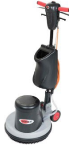
Dual Speed Single Disc Machine