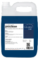
Proclean All Purpose Cleaner

Note: Regular buffing will enhance and maintain the appearance of studded rubber flooring.