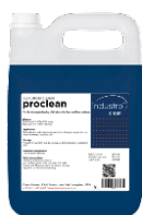
Proclean All Purpose Cleaner