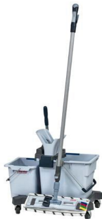
Vileda Microfibre Flat Mopping Unit