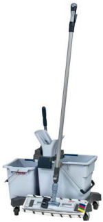
Vileda Microfibre Flat Mopping Unit