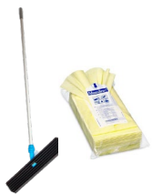
Masslinn Tool & Masslinn Cloths