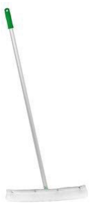
Unger Wonder Waxer Applicator